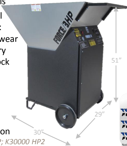
part#: K30000 HP; K30000 HP2