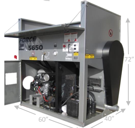
Intec Part # TM5650G for gas