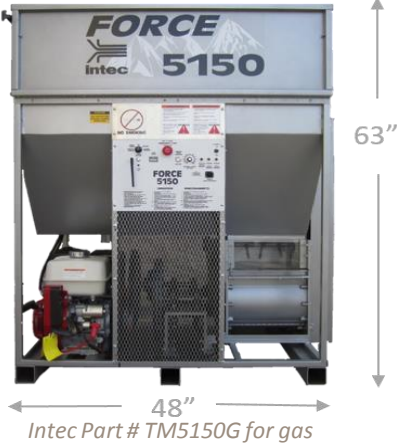
Intec Part # TM5150G for gas