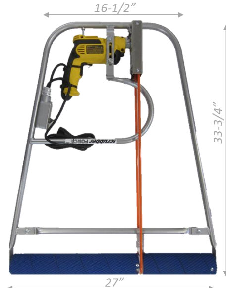
scrubber FORCE® XF27

Compliment with an Intec Recycle Hood, Fluid Delivery System, or Wall Spray Nozzle (see reverse)