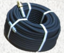
3,000psi high pressure hose