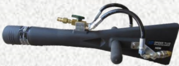
JM Spider PLUS HDN Part#: J53050-S