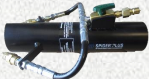
JM Spider PLUS Utility Nozzle Part#: J53000-01-S