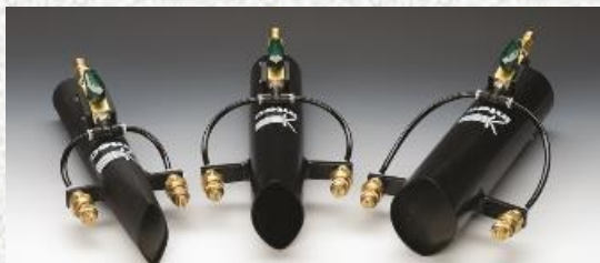
Part#: K3000 2" inlet Part#: K3001 2-1/2" inlet Part#: K3002 3" inlet