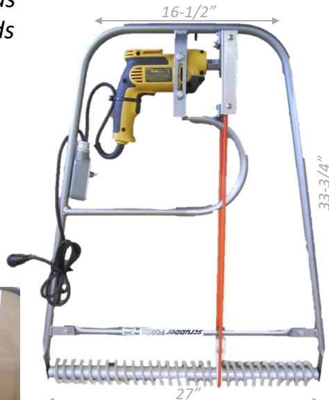
scrubber FORCE® XC27