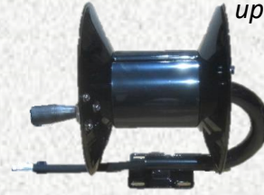
Gen 3 Hose Reel