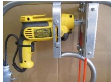
Belt Safety Shield