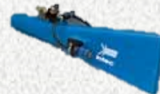
Part#: K3200 2" inlet