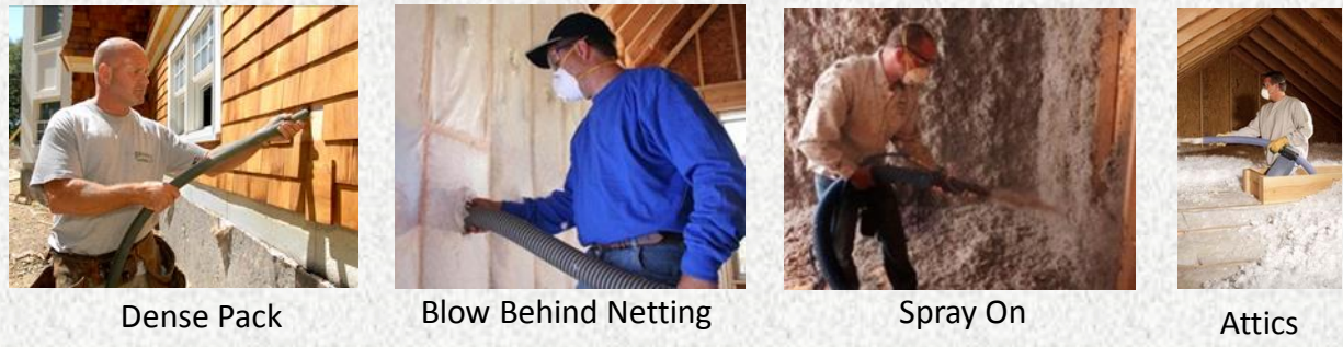
Dense Pack Blow Behind Netting Spray On Attics