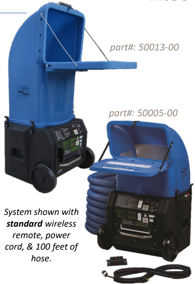
System shown with standard wireless remote, power cord, & 100 feet of hose.

The wireless remote enables operation from the installation location without the requirement of taking a cord with you.