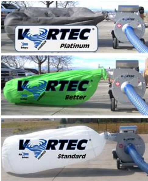
shown with VORTEC Beast vacuum