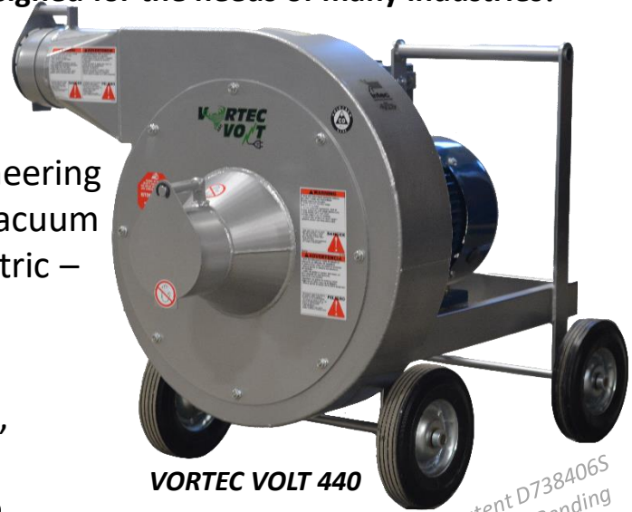
VORTEC VOLT 440

Intec's VORTEC family of high-powered vacuums offer high productivity with robust engineering to provide the highest value vacuum in today's market. Gas or Electric – we got you covered.