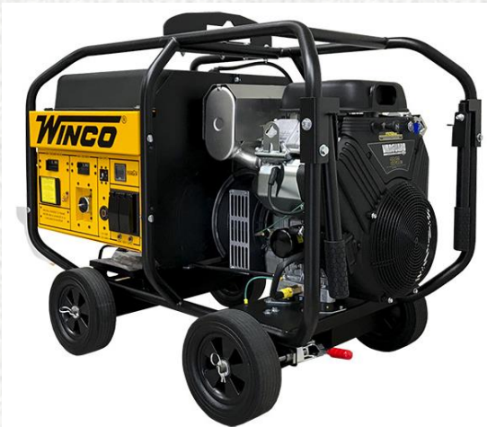
Wheel Kit Part #: 77002-16