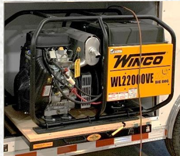
Slide Out – options available