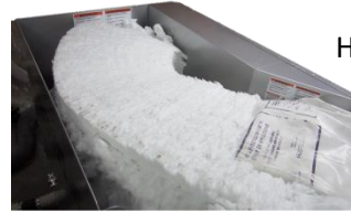
Hopper holds volumes of insulation