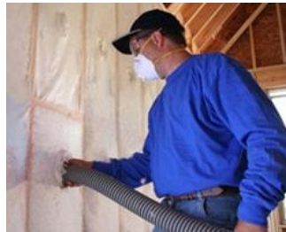
Blow Behind Netting