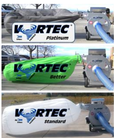
shown with VORTEC Beast vacuum