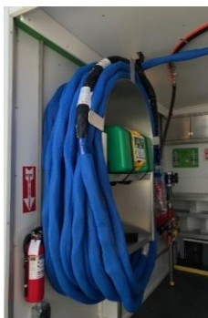
Hose Hood with Shelves