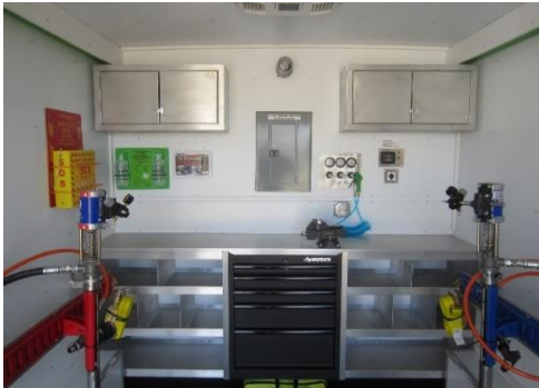
Storage Items Cabinets & Shelves