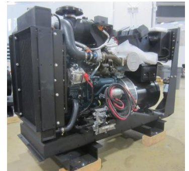
Generators & compressors