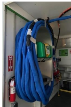
Hose Hood with Shelves