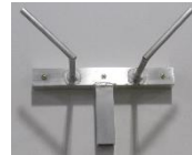
Air hose hooks