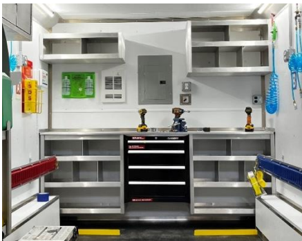
Storage Items Cabinets & Shelves