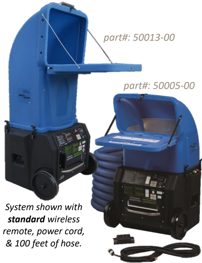
System shown with standard wireless remote, power cord, & 100 feet of hose.