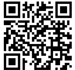
See it in action