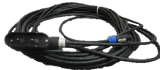
System shown with standard heavy duty wired remote & industry exclusive urethane jacketed controls for enhanced durability

Intec’s FORCE/2 HP comes with these industry leading components on which it has built its reputation for durability and reliability: