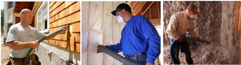
Kits for Dense Pack, Blow Behind Netting, and Spray-on