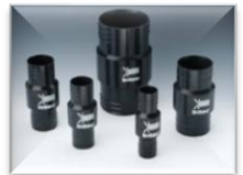
Swivel hose connectors & hose kits