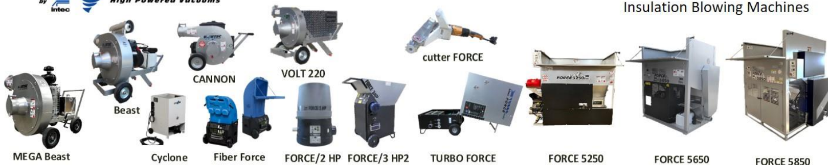
MEGA Beast Cyclone Fiber Force FORCE/2 HP FORCE/3 HP2 TURBO FORCE FORCE 5250 FORCE 5650 FORCE 5850