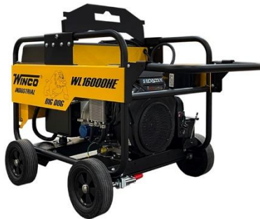
Wheel Kit Standard