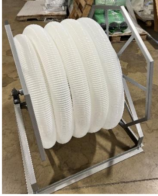
With 4" Blow Hose