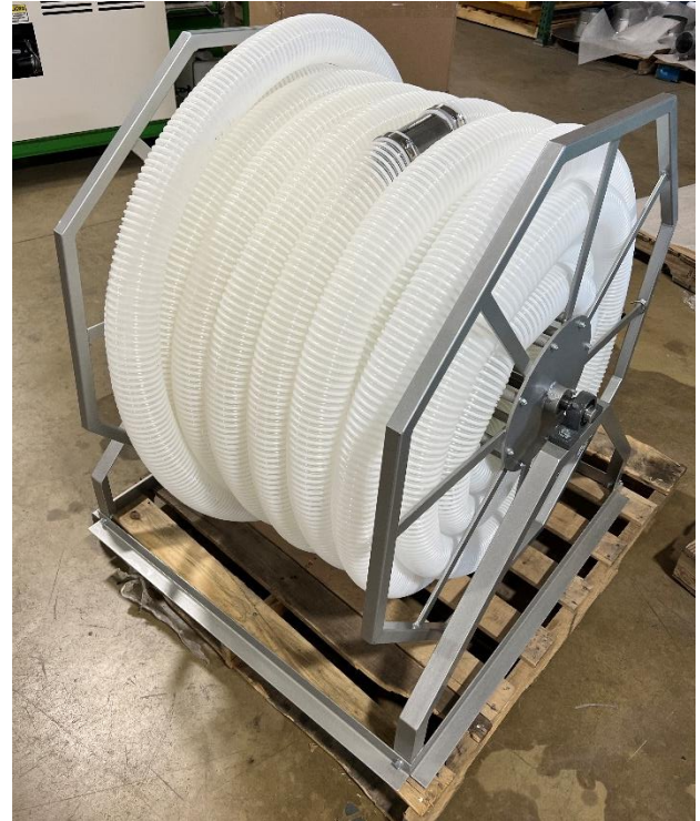
With 150' – 3" Mark II Blow Hose

Hose Reel can be used for Blowing Machine or Vacuum Hose. Capacity: