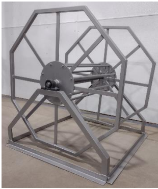
Left Side Angle View