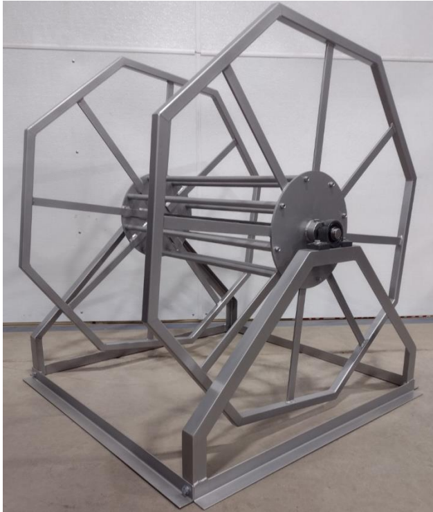
Right Side Angle View