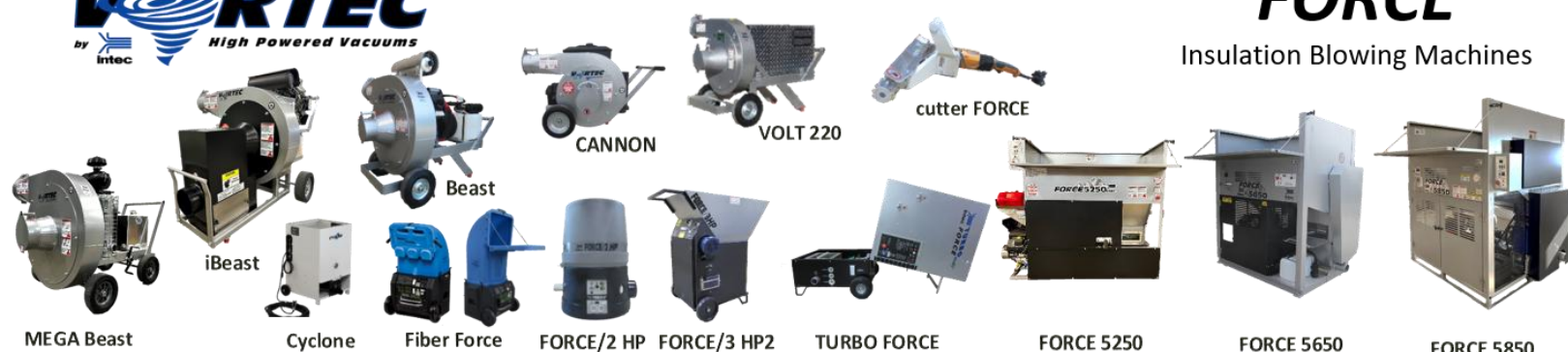
MEGA Beast Cyclone Fiber Force FORCE/2 HP FORCE/3 HP2 TURBO FORCE FORCE 5250 FORCE 5650 FORCE 5850