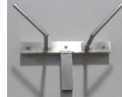
Air hose hooks