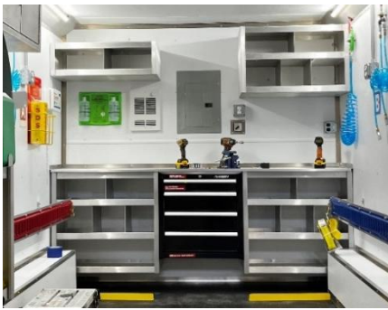
Storage Items Cabinets & Shelves