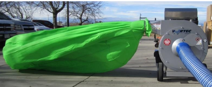
VORTEC Better vacuum bag with Intec's VORTEC Beast