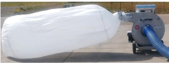
VORTEC Standard vacuum bag with Intec's VORTEC Beast