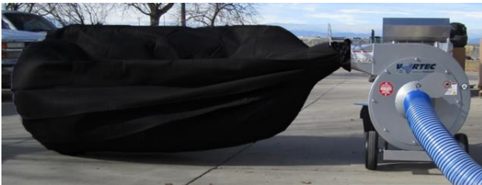
VORTEC BLACK vacuum bag with Intec's VORTEC Beast