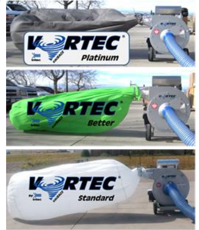
shown with VORTEC Beast vacuum