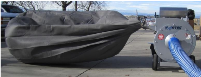
VORTEC Platinum vacuum bag with Intec's VORTEC Beast