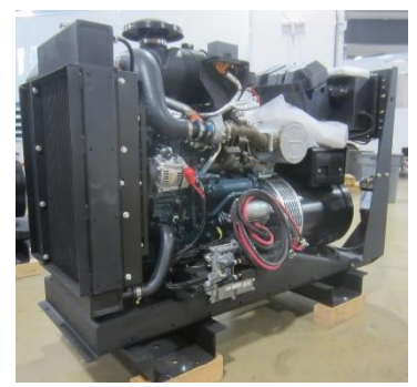
Generators & compressors