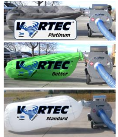
shown with VORTEC Beast vacuum