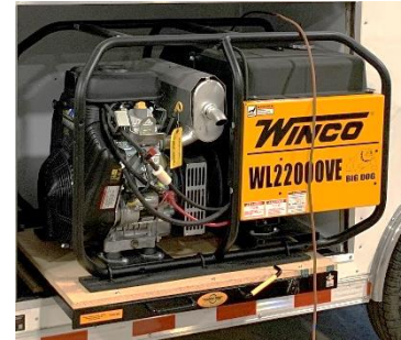
Slide Out – options available Part #: 77045-00 or 77046-00