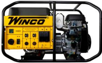
Rugged Steel Design,

Professional Grade – 18,000 Watts ~ Meets Contractors' Demands