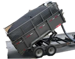
VORTEC PLATINUM Trailer vacBAG